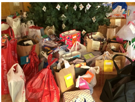
Advent Peace Tree

† In 2017-2018, our Faith Formation Team distributed our 6th annual parish book, The Wind in the Reeds . The parish book program has been made possible each year through annual grants from the interest earned on our parish’s education endowment fund. The 7th annual parish book, Stranger God , being distributed this fall, will bring the total number of books provided through the annual grant to nearly 5,000 since 2012.