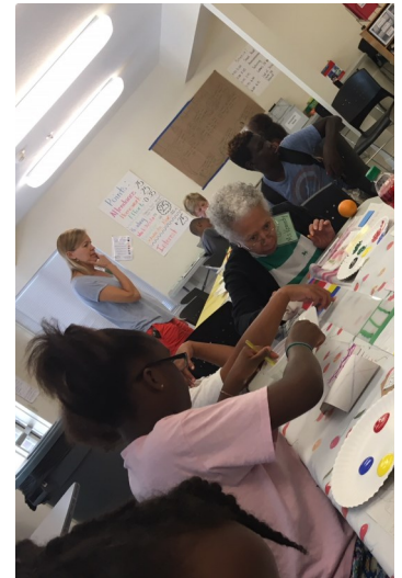
Volunteers & children work on an art project together at The Learning Club

† The Visitation/St. Francis Xavier Community Garden, located on the grounds of St. Francis Xavier, has become a vital part of the food pantry ministry at SFX. Since its start in 2016, over 3,300 pounds of produce have been planted, harvested and distributed to those in need: 2016—1,007 pounds, 2017—1,558 pounds and, to date in 2018—755 pounds. Our garden volunteers are hopeful to again reach 1,000 pounds this year with the fall harvest. Crops include beets, turnips, collard greens, sweet peppers, cabbage, swiss chard, sweet potatoes, cucumbers, tomatoes and, for the first time in 2018, peaches.