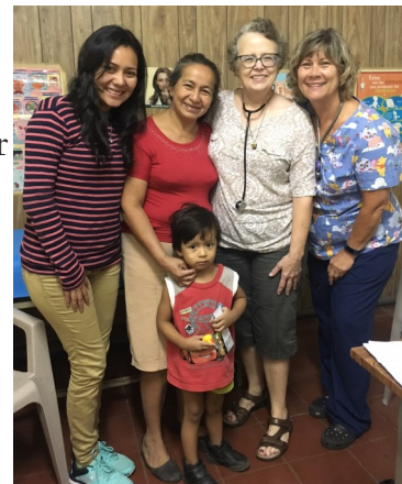
Medical delegation 2017