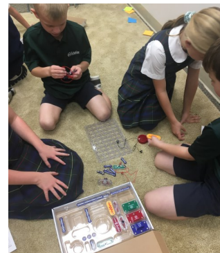
Second grade students use snap circuits

† The Cash Call at the 2017 Visitation School auction raised over $60,000 which was used to fund a “maker space” for our school. Items bought for the space include a 3-D printer, codable robots, circuitry kits and other hands-on materials to help students tinker, explore and create. Students have access to maker space materials through Wonder, a new Specials class that encourages student creativity, expression, cultural understanding and social-emotional learning. Maker space materials are also available for teachers to check out and use in their classrooms.