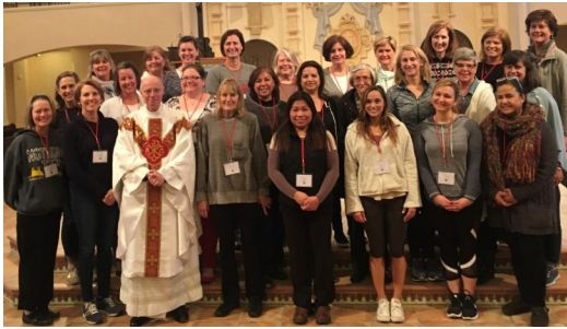
Christ Renews His Parish 2018

† Since beginning the Christ Renews His Parish program at Visitation in 2013, over 350 men and women have made a CRHP retreat. This fall, Visitation is giving the gift of Christ Renews to St. Ann's Parish in Prairie Village by offering the first men's and women's retreats for their parish.