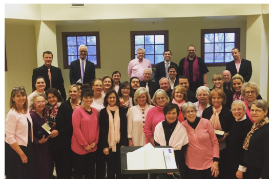
Visitation Choir 2017-18

† Music is an essential part of our liturgies and other celebrations at Visitation. Our cantors, choir and handbell choir rehearse weekly September through Pentecost and prepare over 50 special musical offerings in addition to the communal hymns and Mass parts sung by the entire congregation.