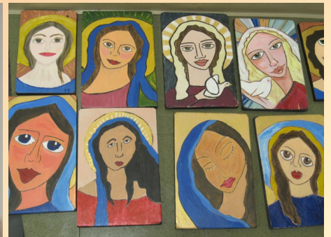
Scenes from 2017-18 Faith Formation Supper Series events

"Therefore, encourage one another and build one another up, as indeed you do." - 1 Thessalonians 5:11